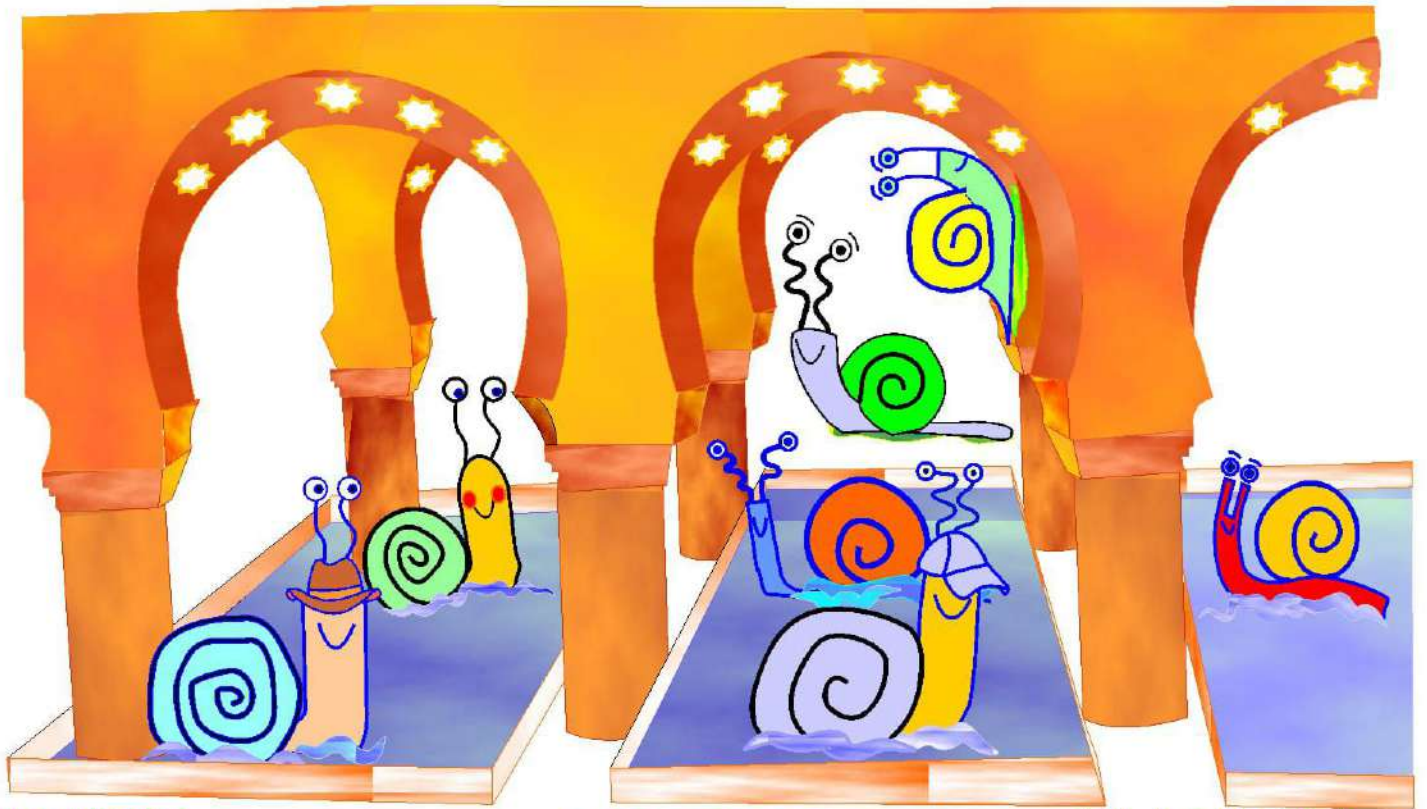
SALA FREDA (BAYT AL-BARID)